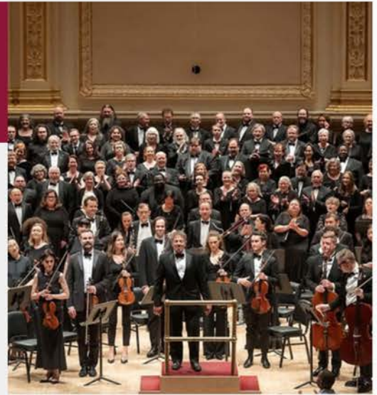
Singers and musicians from across the country, including show choir students from Wallace, performed at Carnegie Hall in New York City on June 1, 2024.