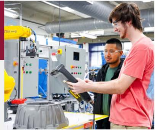
Students in the Industrial Systems Technology program work with an industrial robotic arm in the program's skills lab.

These initiatives prepare students for high-demand careers across various sectors, including manufacturing roles like industrial machinery mechanics and IT fields such as cybersecurity specialists and network administrators. The fellowship program will further address workforce needs by offering selected students from three colleges a 16-week course combining hands-on labs and paid on-the-job training with industry partners. Supported by regional collaborations, these programs aim to equip students with critical skills, fostering a workforce ready to meet Alabama's evolving economic demands.