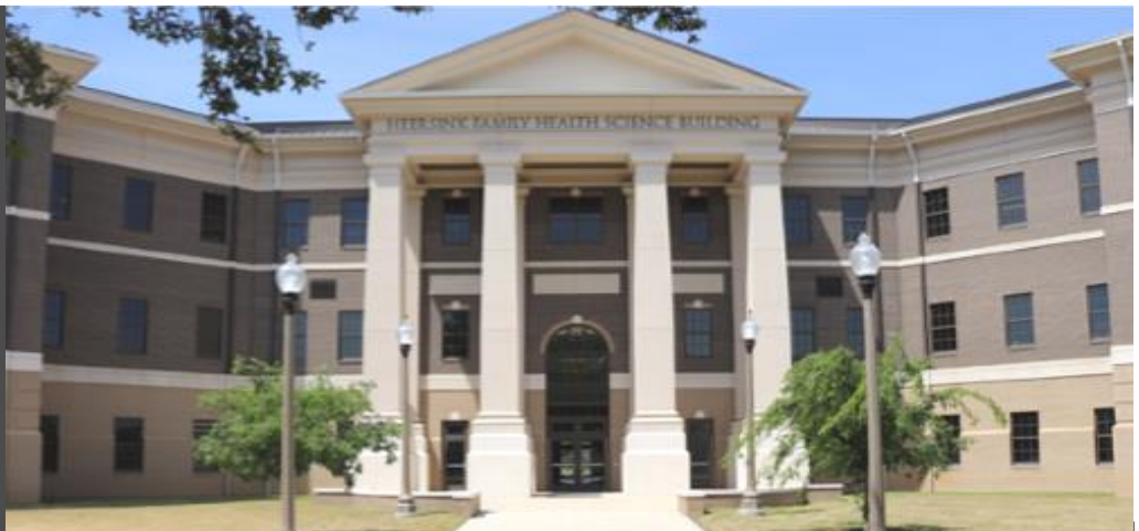
Heersink Family Health Science Building