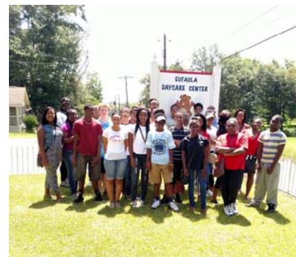
Talent Search participants from Abbeville, Barbour County, and Eufaula High Schools pause for a picture after completing community service at Eufaula Day Care Center.