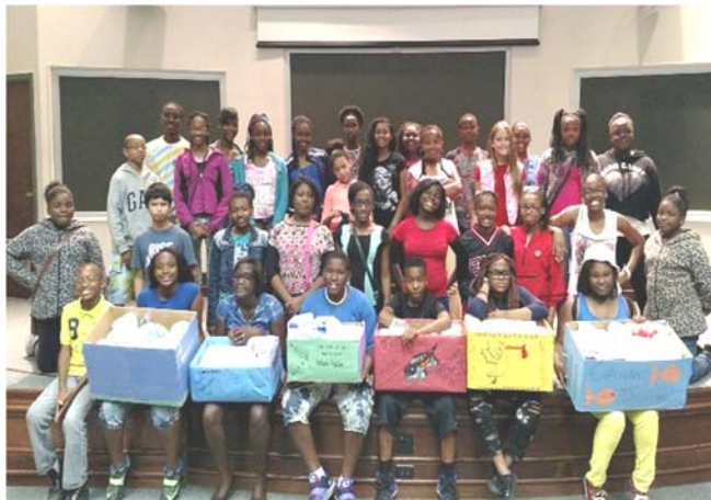
Middle school Talent Search participants with boxes of paper products to be donated to the Eufaula Day Care Center.